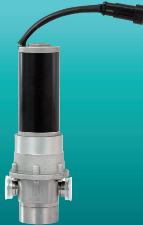
SJ100A尿素计量泵 SJ100A urea metering pump