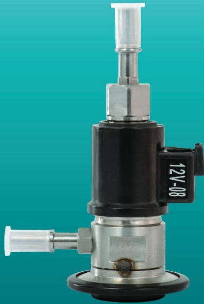
SP095-000尿素喷射器 SP095-000 urea injector