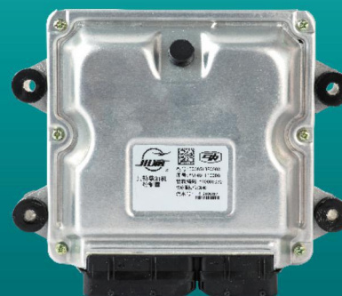
CYCR-2中型共轨ECU CYCR-2 medium duty common rail ECU