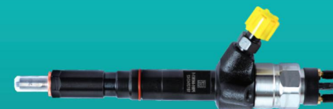
CYCR-2中型共轨喷油器 CYCR-2 medium duty common rail injector